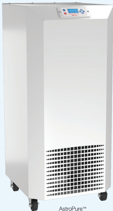
AstroPure™ Portable Air Purifier

To ensure the cleanest possible air for employees and diners, the AAF Flanders team proposed stationing multiple AstroPure portable air purifiers in strategic locations.