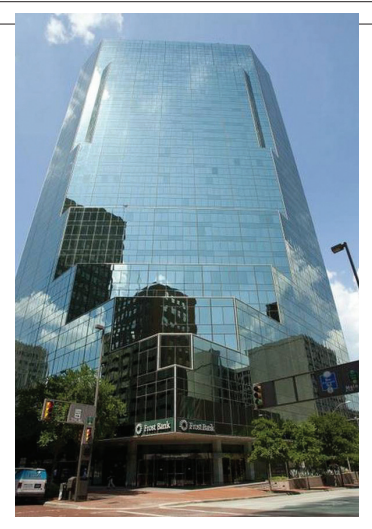
777 Main Street.