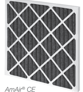
Amair<sup>®</sup> CE Pleated Carbon Filter