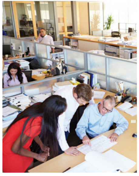
Our air filtration team understands that the requirements for commercial facilities differ for each application. Our experience in developing air filtration products for a variety of industries gives us the know-how to tackle any project.