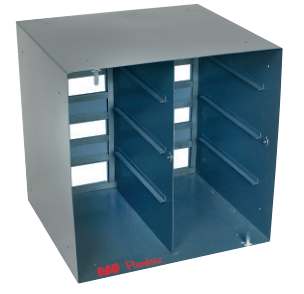
SAAF™ Front-Access Housing