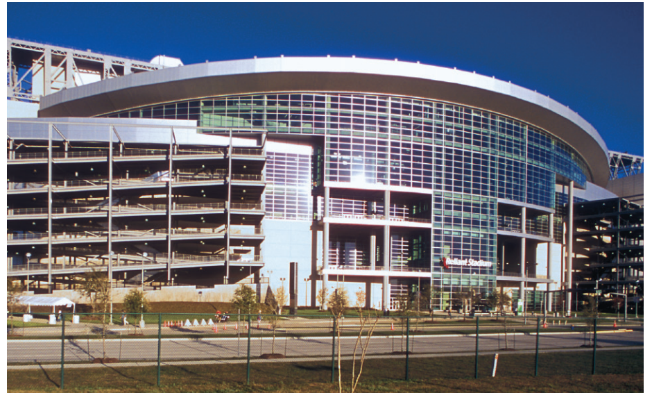
AAF Flanders filters are at work in Reliant Stadium in Houston, Texas, USA.