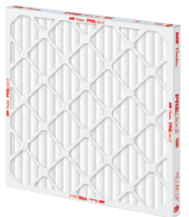
PREpleat® MERV 13