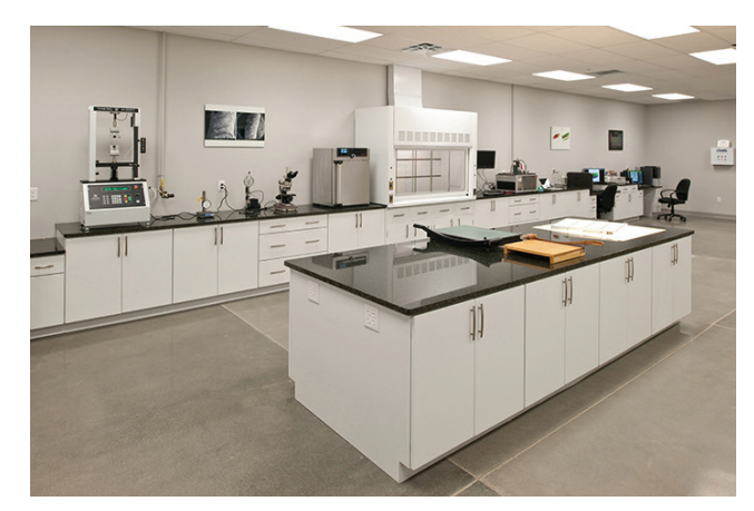
AAF Flanders operates its Clean Air Innovation & Research Center (Clean AIR Center) near its World Headquarters in Louisville, Kentucky.

Only AAF Flanders has a long history with deep, technical knowledge and archives to bring the experience, expertise, and reliable data to the customer. Our mission is to help you protect your environment, reduce your business risk, and optimize your clean air related spending. We will always strive to invest our time and expertise to help you improve your business, not just to sell you a product.